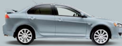
COOL SILVER (M)