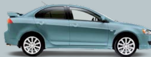
MYSTIC BLUE (M)