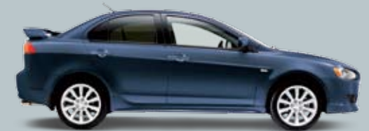
LIGHTNING BLUE (P)

METALLIC (M) AND PEARLESCENT (P) PAINT ARE OPTIONAL EXTRAS.