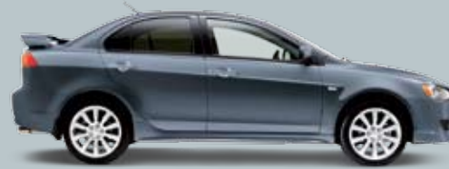
EFFECT GREY (P)